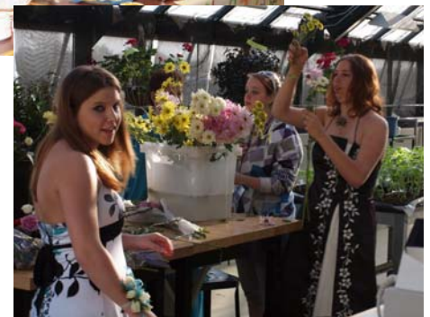
CTC Open House April 20, 2010