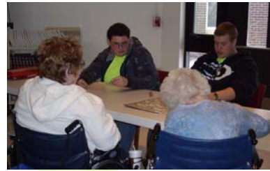
CTC Student Forum Representatives visited Lakeview Lutheran Manor on February 12, 2009 to play games with the residents and pass out Valentine's Day Cards.