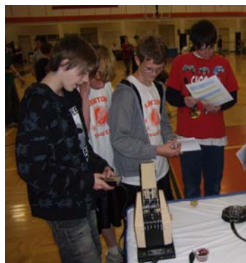
CTC Career Expo at Manton Consolidated Schools

(BMA) class where they participated in a technology lesson. The students participated in a technology lesson by creating their own personalized Mothers' Day cards on the computer. They used digital photography and did their own keyboarding and graphics on the computer (with the help of their BMA student helpers). Afterwards, they were treated to cookies and juice and a short tour of CTC.