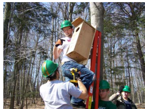
CTC Agriscience students installed wood duck houses on Waldeck Island.